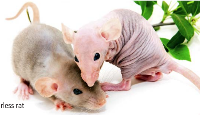
furry and hairless rat

How can that be? The answer is genes . Genes are instructions for your cells. They help make you who you are, from the color of your hair to how tall you will grow.