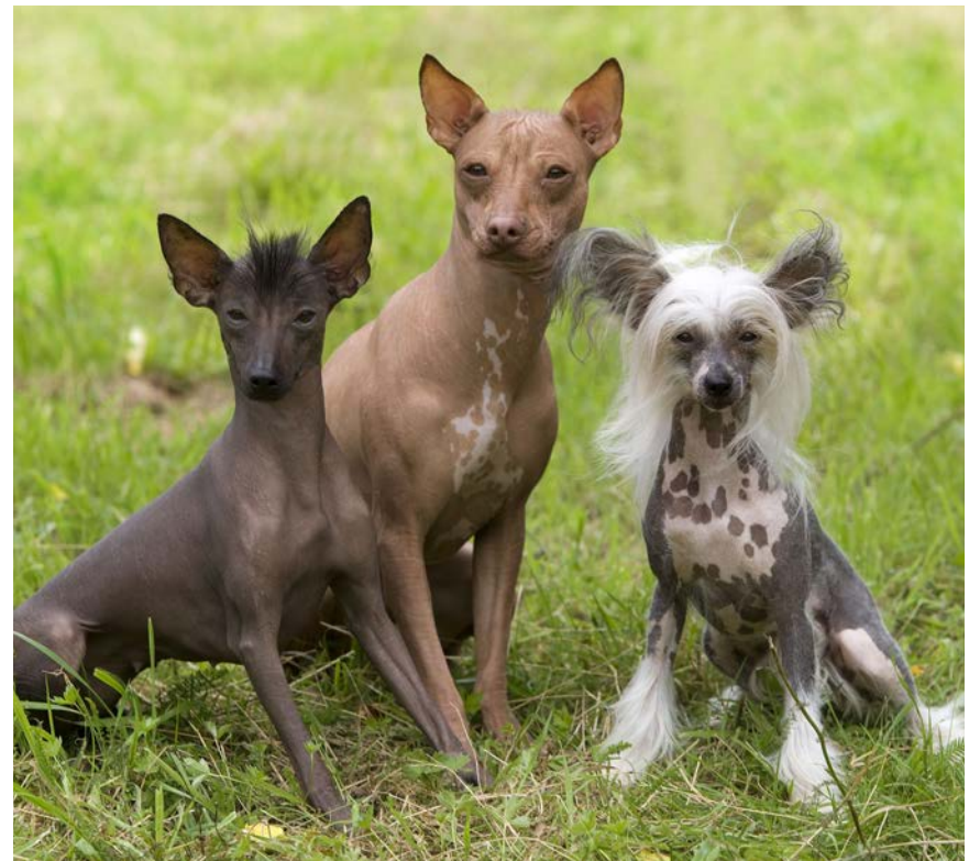
Who you calling hairless? Three hairless breeds—Peruvian Inca orchid, Mexican xolo, and Chinese crested—are ready to stand up for hairless pets everywhere.

Hairless animals are everywhere. They can be wild animals or cuddly pets. Some hairless animal breeds are thousands of years old, while others are brand new. Who knows what kind of hairless animal will pop up next?